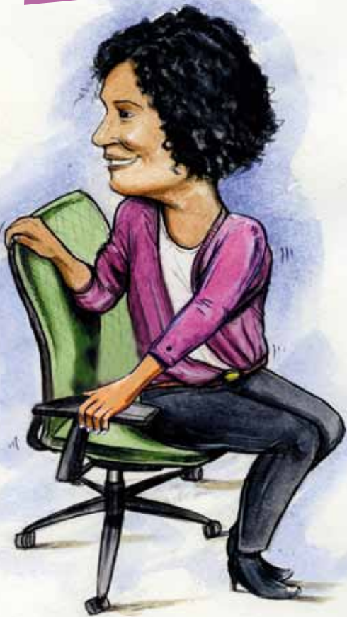
ILLUSTRATION: MARC GOODERHAM