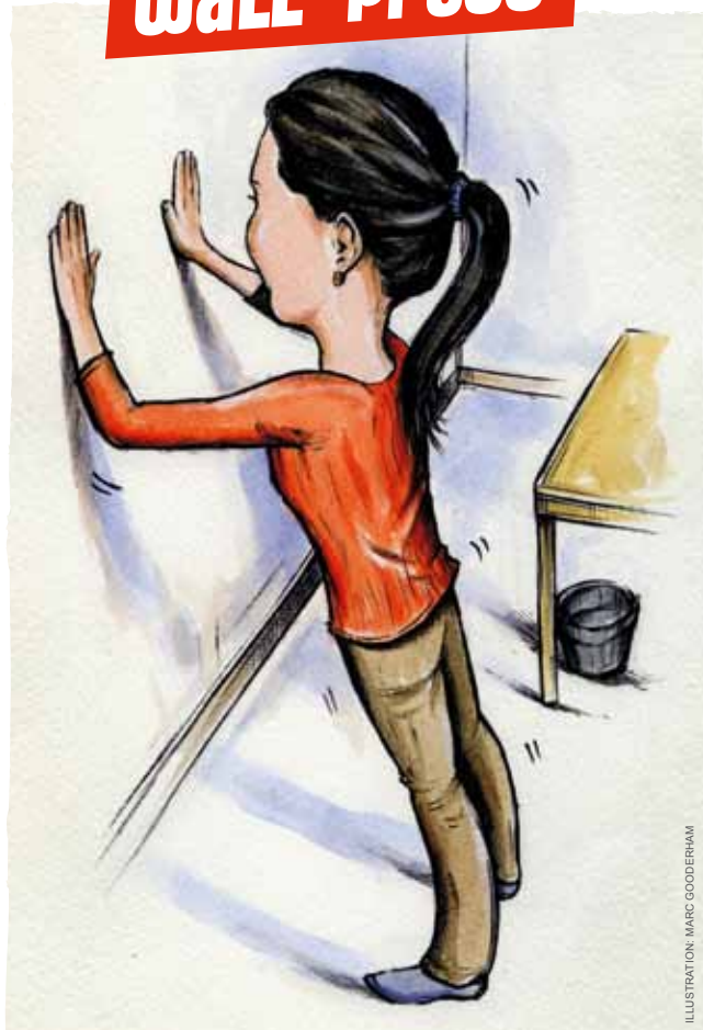
ILLUSTRATION: MARC GOODERHAM