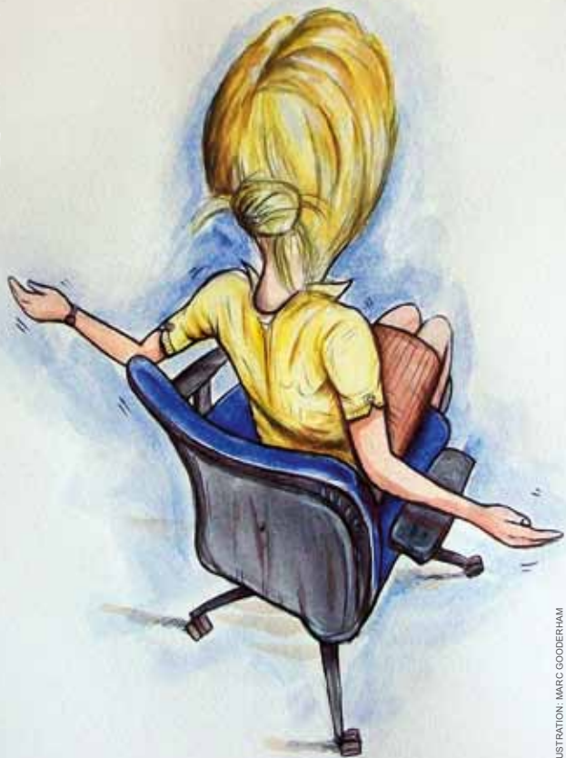
ILLUSTRATION: MARC GOODERHAM